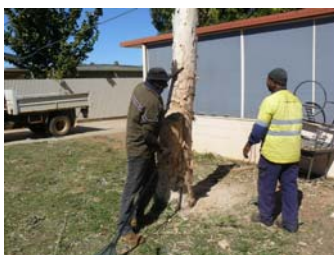
General Gang team members

Our General Gang are being kept extremely busy keeping the town in shape. They have been cutting grass, cutting back overhanging trees across roads. At the moment, they are working their way through the town, doing footpaths, manholes, tree pruning and a general tidying up in preparation for a major street resealing program that will begin later this year.