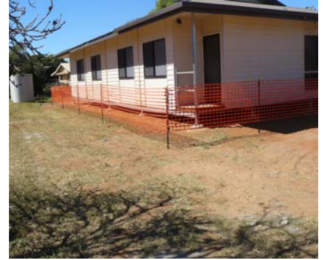
New houses arrive in Doomadgee

In the meantime, the upgrades and maintenance programs will continue.