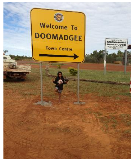
One of three new welcome to Doomadgee signs

In the coming year you will see signs around town pointing people to the shop area so that they do not get lost in the residential areas of town, and signage that says only local traffic only, to also try and reduce traffic that is not Doomadgee residential traffic from the residential areas.