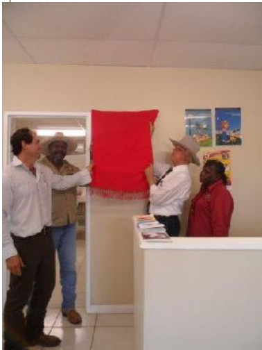
Honorable Bob Katter, Councilor Cairns and The vet Staff

The Animal Management Clinic is now completed and has been used 3 times by the visiting veterinary staff and they are finding the facility very satisfactory to conduct clinics in. The clinic includes a reception and waiting room, consultation and surgical area along with a hydra bath for the dog washing.. The Clinic was officially opened by Honorable Bob Katter on the 28th of November at 11pm .