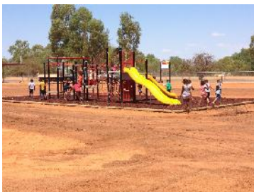
New playground with Children enjoying the play set

Still to come is three barbecue areas under the three shelters that will have a barbecue and seating. The barbecue area will have solar lighting installed in the coming months to make them an enjoyable place to have an evening BBQ . The park is also having a graffiti wall erected that can be used