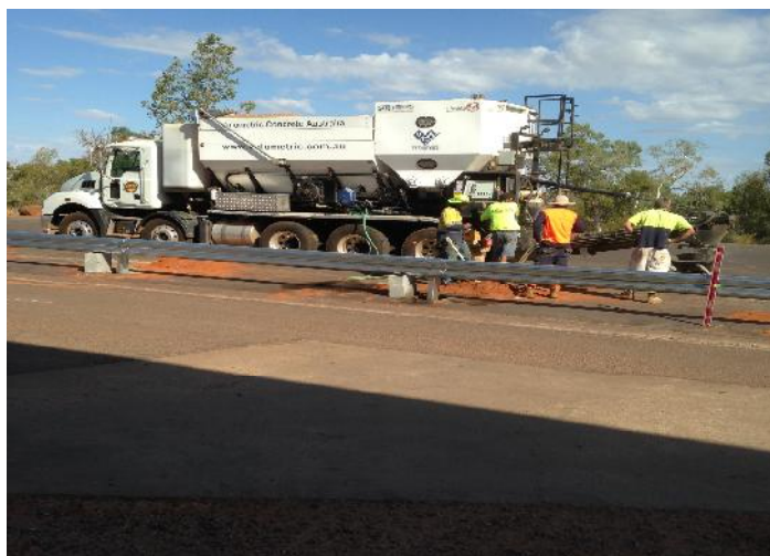
Installation of the Safety Guard Rail at the Community Store and the concrete needed mixed in our own newly purchased truck

The council fleet will last well into the future with David and Clayton giving the machinery it usual good care.