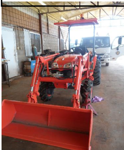
One of the new trucks behind the new tractor